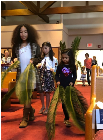
Palm Sunday Procession